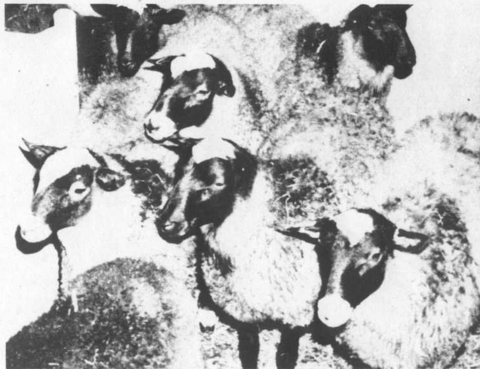
Four-month old lambs born during the quarantine.

lambs, not bad for an illegal romance! One ewe was found to have 4 functioning teats. Two lambs also had 4 teats and it will be interesting to find out if we can develop a herd with all animals carrying this trait. Who knows, probably the next step would be a sow-like udder. The sheep are now being prepared to start their scheduled (legal this time) breeding season in early September. What are the plans for this breed? For two years they will simply be left to multiply, while preparations will be