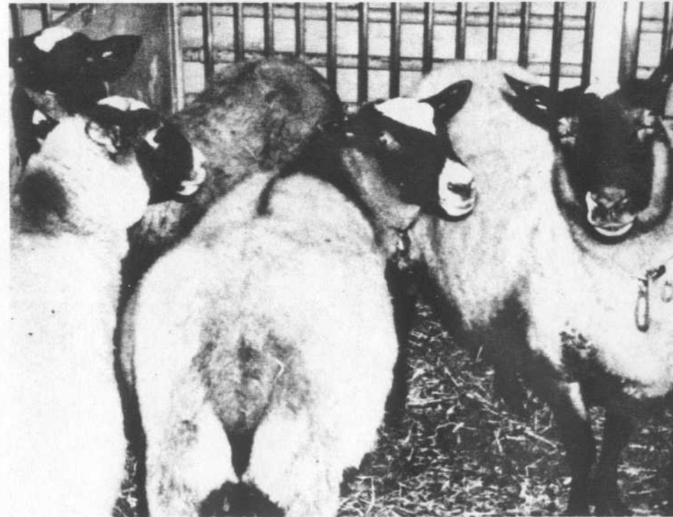
Above are the four imported Romanov ewes which lambed.

Lennoxville, Quebec. Unfortunately two males and two females had to be slaughtered because they reacted positively to the test of Brucellosis. It is sad to see $14,000. disappear but it is a risk each importer has to take. However, in return we got completely unexpectedly 12 lambs born during the quarantine which resulted from unscheduled (though welcomed) romances over the